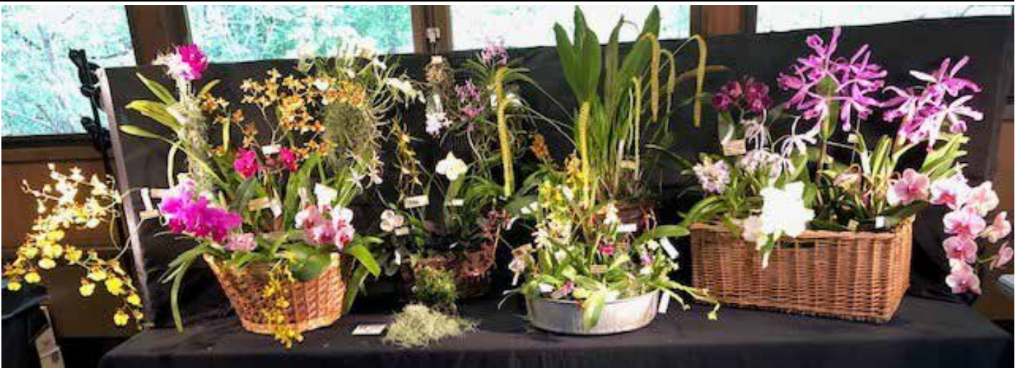
The GROS Exhibit at CNYOS Show