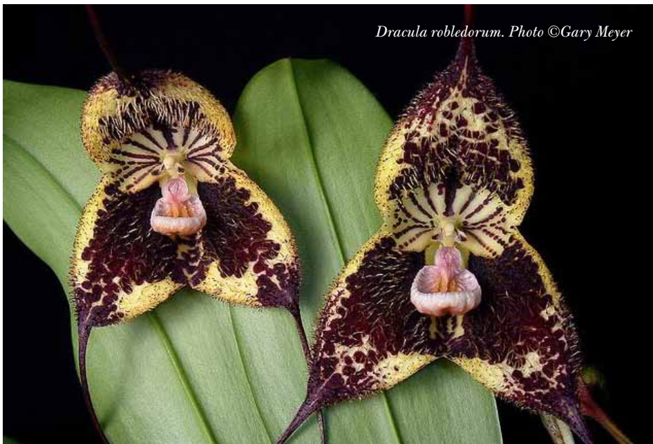
Dracula robledorum.

“Orchids 101” 6:00 p.m. ❁ Social “Hour” 7:00 - 7:15 p.m. ❁ Meeting begins at 7:15 p.m. Senior Lounge, Jewish Community Center, 1200 Edgewood Ave., Rochester, NY