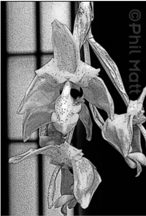
Stanhopea jenishiana - grown by Marlow Orchids. GROS Spring Show, April, 2006.

Senior Adult Lounge at the Jewish Community Center, 1200 Edgewood Avenue, Rochester, NY