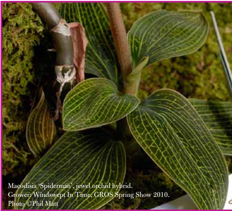
Macodisia 'Spiderman', jewel orchid hybrid. Grower: Windswept In Time, GROS Spring Show 2010.

“Orchids 101” 6:00 p.m. ❁ Social “Hour” 7:00 - 7:15 p.m. ❁ Meeting begins at 7:15 p.m. Senior Lounge, Jewish Community Center, 1200 Edgewood Ave., Rochester, NY