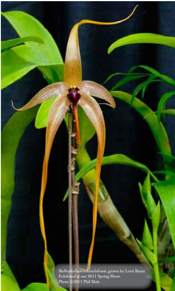
Bulbophyllum echinolabium , grown by Lorri Bayer. Exhibited at our 2011 Spring Show.

“Orchids 101” 6:00 p.m. ❁ Social “Hour” 7:00 - 7:15 p.m. ❁ Meeting begins at 7:15 p.m. Senior Lounge, Jewish Community Center, 1200 Edgewood Ave., Rochester, NY