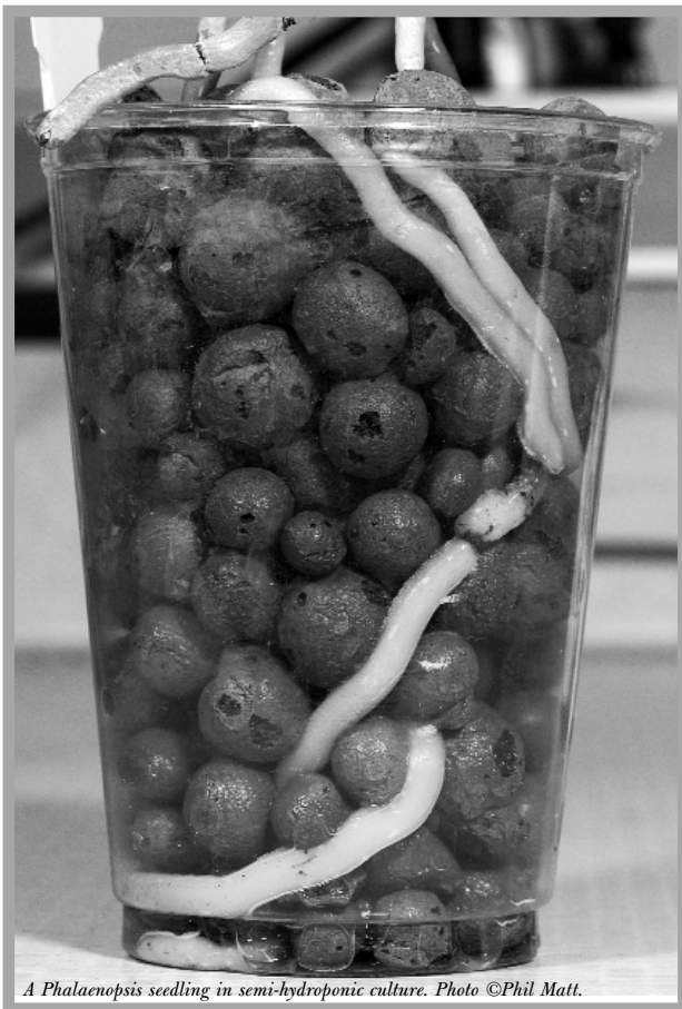
A Phalaenopsis seedling in semi-hydroponic culture.