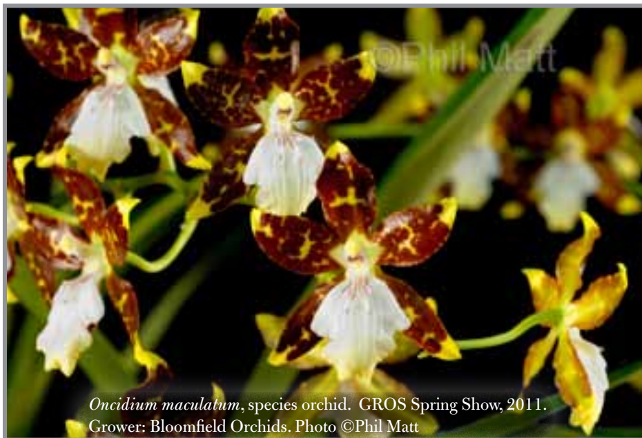
Oncidium maculatum , species orchid. GROS Spring Show, 2011. Grower: Bloomfield Orchids.

“Orchids 101” 6:00 p.m. ❁ Social “Hour” 7:00 - 7:15 p.m. ❁ Meeting begins at 7:15 p.m. Senior Lounge, Jewish Community Center, 1200 Edgewood Ave., Rochester, NY