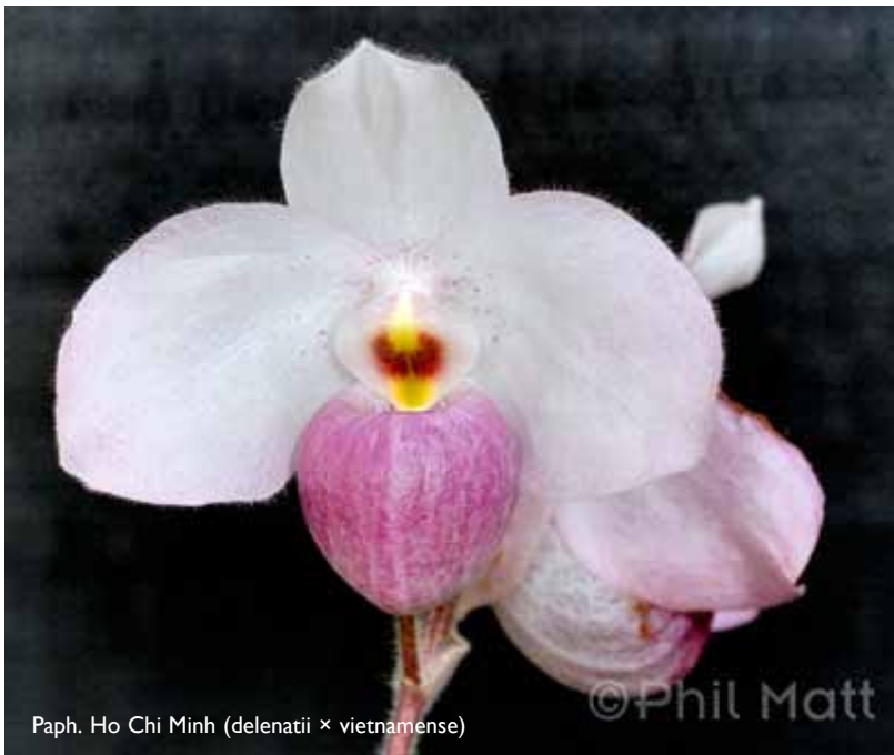
Paph. Ho Chi Minh (delenatii × vietnamense)

"Orchids 101" 6:00 p.m. ❁ Social "Hour" 7:00 - 7:15 p.m. ❁ Meeting begins at 7:15 p.m. Senior Lounge, Jewish Community Center, 1200 Edgewood Ave., Rochester, NY