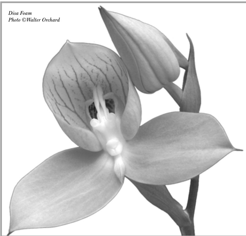
Disa Foam

We've decided that investing in futures is the way to go. No, not pork belly futures or soybean futures - more in the way of Brassia futures, Phalaenopsis futures, Cattleya futures, Masdevallia futures, Paphiopedilum futures, Dendrobium futures - you get the picture. There's nothing like the approach of our Spring show to stoke our interest in futures!