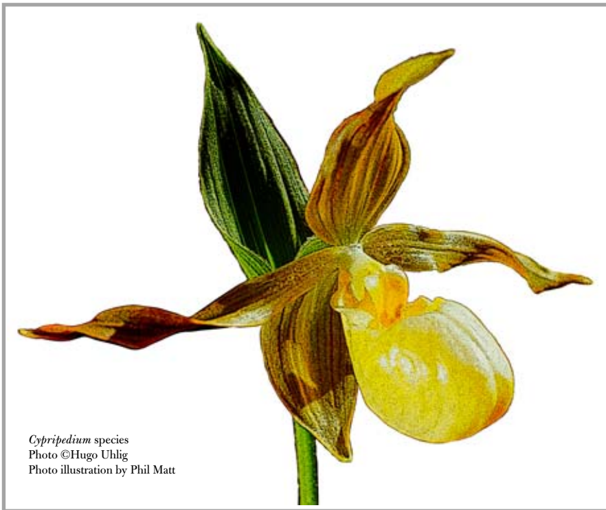
Cypripedium species Photo ©Hugo Uhlig Photo illustration by Phil Matt

The weather in these parts is just plain inscrutable. We've gone from blizzards to shirt-sleeve season - all in just a week! The only thing more confusing than this would be for me to attempt to explain to you (even semi-coherently...) the Show Table award point system from the holiday meeting.